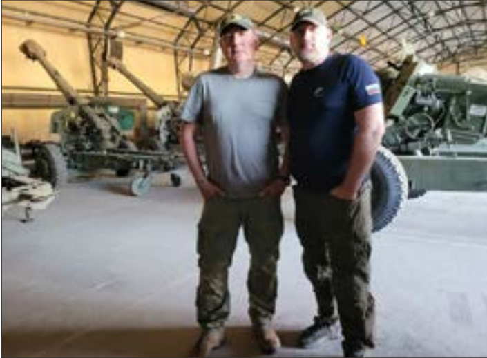
Pikalov with Dmitry Olegovich Rogozin, a Russian politician serving as the senator from Zaporozhye Oblast since September 23, 2023