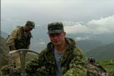
Young Nizhevenok. The landscape suggests this photo might have been taken in the North Caucasus