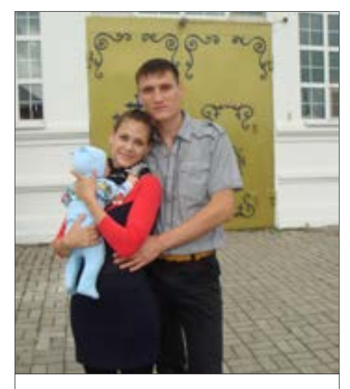
Kitaev with his family <u>Source</u>