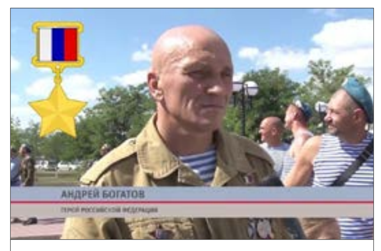
Hero of Russia medal, \mathsf{YBK} Vkontakte channel post \underline{Source}